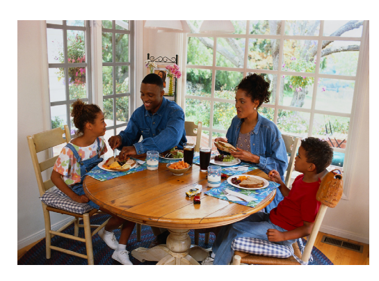
"We only had one chair in our home, and now we have a dining room set, a couch, and a chair thanks to Bridging AZ."

The furniture and household items you collect helps individuals and families from over 30 social service agencies create a safe, comfortable and healthy home. Our resources depend on generous community donations, a furniture drive is a great way to ensure Bridging AZ has the items needed to serve those in need